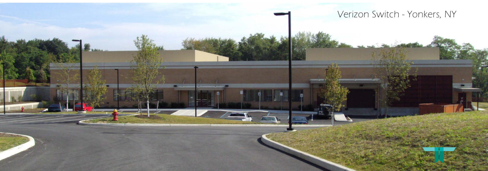
Verizon Switch - Yonkers, NY

Verizon Wireless - Pennsylvania and New Jersey MSC Switch Design Expansions including Architectural/ADA/Life Safety, Structural/Seismic, Mechanical Systems, Electrical Systems, Plumbing Systems, Security, Fire Detection/Fire Suppression, Building Automation Systems, Basis of Design, Project Specifications, Equipment Cuts/Systems Review, and Engineering Cost Estimates/Project Schedule